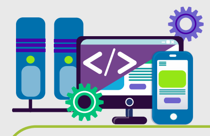
Capgemini Invent integrated the AI model into backend systems and customized user frontends